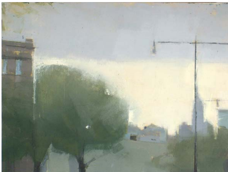
View from Long Island City, 2008, oil and pencil on panel, 9 x 12 inches