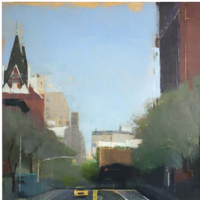
West Village Street #2 , 2008, oil and pencil on panel, 16 x 16 inches