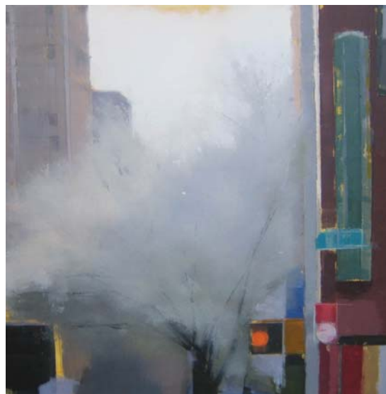
Chelsea, Early Spring #2, 2008, oil and pencil on panel, 16 x 16 inches

Kathryn Markel Fine Arts is a New York-based contemporary art gallery that has been, for over 30 years, a source for a wide variety of fine contemporary art. We specialize in emerging and established artists whose works are intellectually compelling and at the same time beautifully crafted and affordable. KMFA is located at 529 W. 20 th Street in Chelsea, New York 10011. For more information on Kathryn Markel Fine Arts, please visit www.markelfinearts.com .