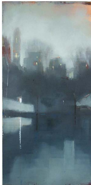
Winter Night, Central Park Lake #2 , 2008, oil and pencil on panel, 20 x 10 inches