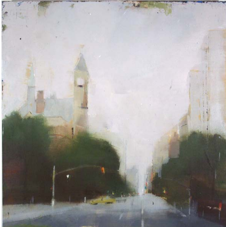
West Village Street #1 , 2007, oil and pencil on panel, 16 x 16 inches

On View November 13—December 20, 2008 Artists' Reception: Thursday, November 13, 6-8PM